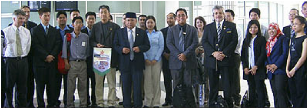
Delegation to Hong Kong with Permanent Secretary at the Ministry of Communications.

Winners of this year's Brunei ICT Awards (BICTA) will be representing Brunei Darussalam at the Asia Pacific ICT Awards 2004 (APICTA) to be held in Hong Kong today until December 10, 2004.